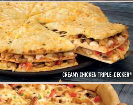
CREAMY CHICKEN TRIPLE-DECKER®