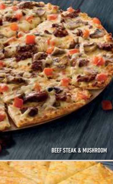
BEEF STEAK & MUSHROOM

Go HALF & HALF in your choice of 2 PIZZA FLAVOURS!